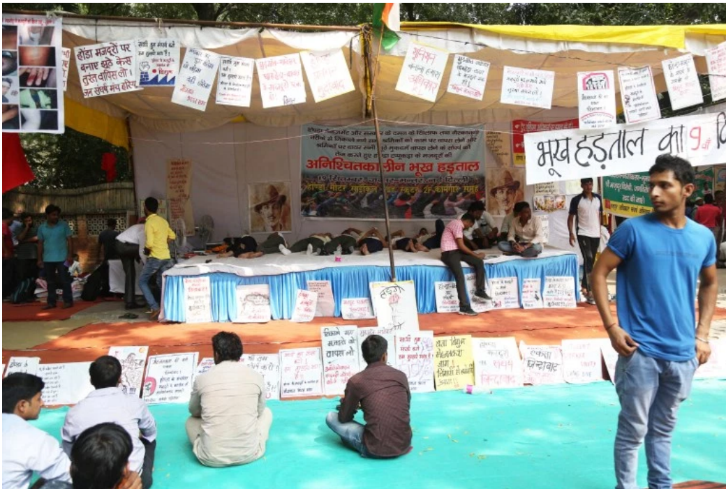
Honda workers on their ninth day of fast take rest while laying down on the stage at Jantar Mantar.

Since the strike began on September 19, each day, activists, students and workers have been participating in a relay hunger strike as well. On Tuesday, four workers from Maruti plants in Manesar and Gurgaon fasted in order to demonstrate their support for the Honda employees.