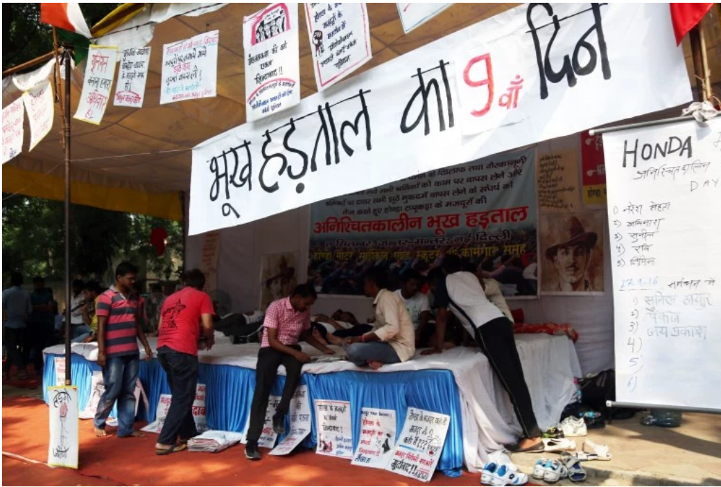
Hunger strike by Honda workers of the Tapukara, Rajasthan plant continues on day nine at Jantar Mantar.