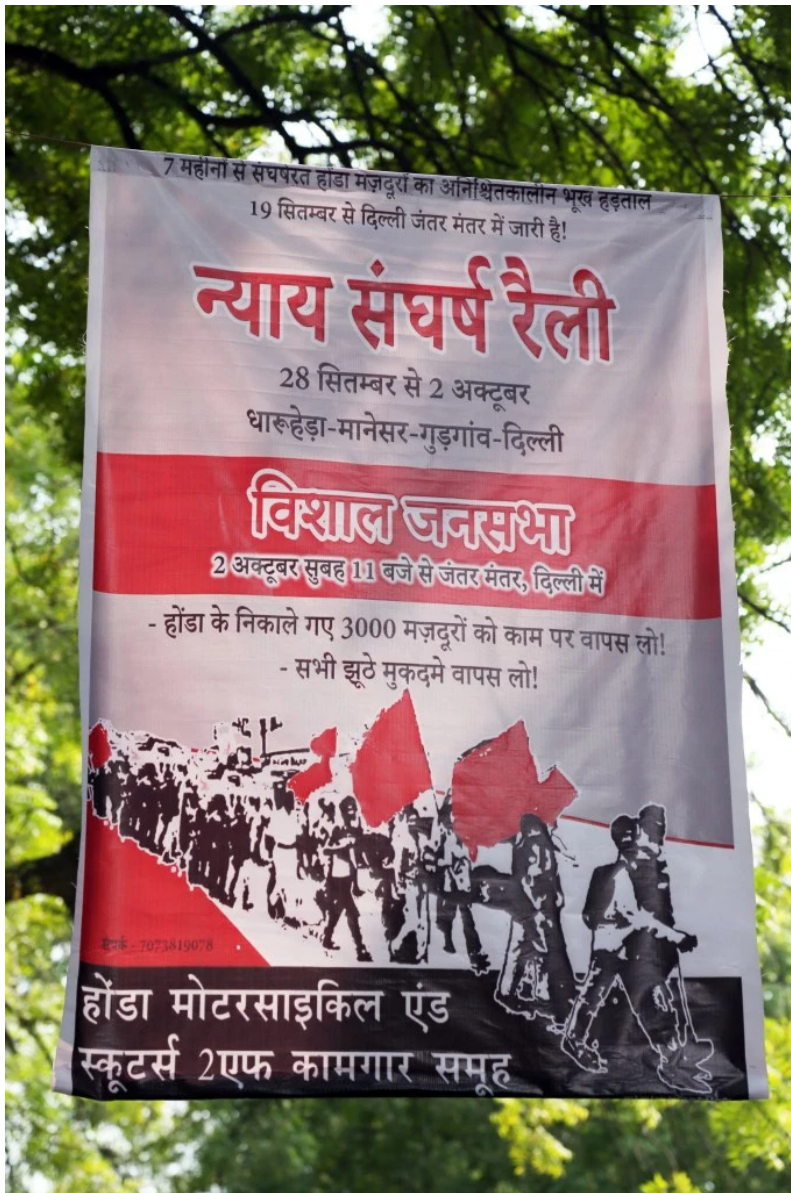
Poster of the 'March for Justice' being held from September 28-October 2 from Dharuhera, Haryana to New Delhi.

Support continues to pour in for the strike. From Wednesday onwards, leaders of other automobile unions such as Maruti Manesar, Maruti Gurgaon, Suzuki Bikes and Munjal Showa, along with trade unions like AITUC, Centre of Indian Trade Unions and Indian National Trade Union Congress will participate in a four-day march from Dharuhera in Haryana to Jantar Mantar.