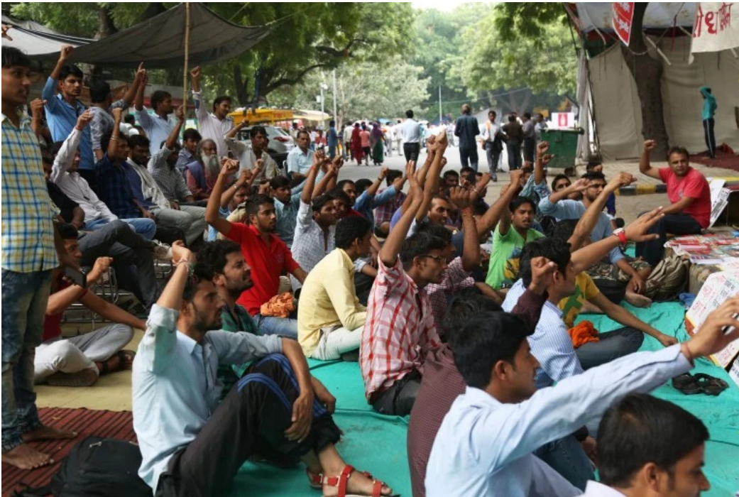
Workers protesting against Honda Rajasthan management at Jantar Mantar.

As strike enters day nine, one worker has already been suspended for 'liking' a Facebook post.