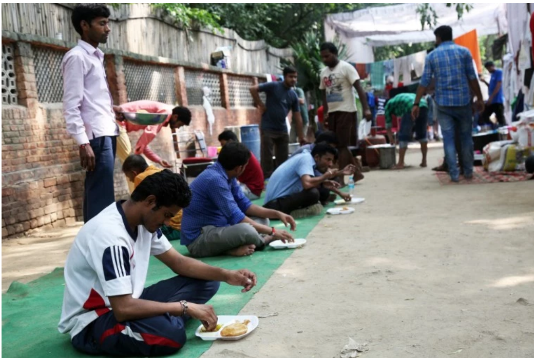
Lunch being served at the community kitchen, an effort funded by workers, activists, unions, and students.

Honda workers came to Delhi to protest the mismanagement and exploitative working conditions of the contract labour at the Honda factory in Tapukara in Rajasthan.