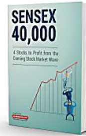
Four Stocks To Profit From The Coming Stock Market Wave equitymaster.com