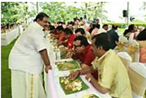
A big fat Malayali wedding 02/08/2016