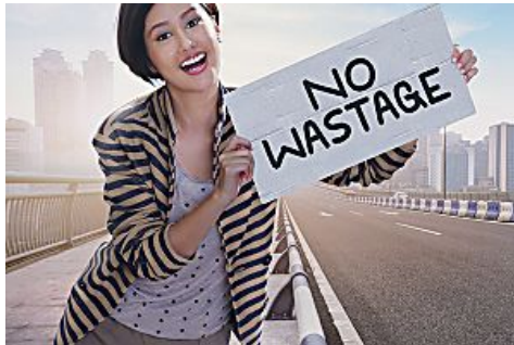
How to save up to 30% on your mobile bill? Airtel