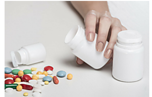
3 diseases that Indians must protect against Big Decisions