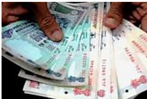
7th Pay Commission arrears to be paid off in one instalment in cash 29/07/2016