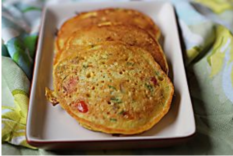
5 healthy breakfast recipes. Saffola Fit Foodie