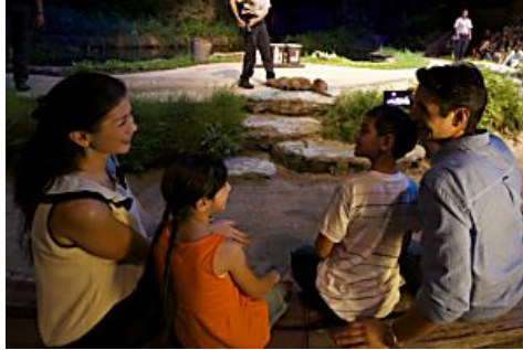
Singapore's 5-Day Guide to Holiday Fun for the Whole Family Singapore Tourism Board