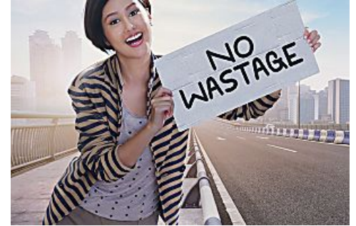
Reduce your mobile bill by 30%! Airtel