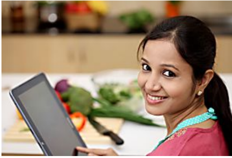
Smart way of investing, start a SIP ABM MyUniverse®