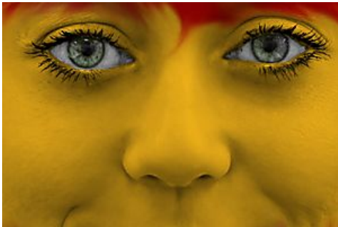
7 Tricks To Learn Any Language In Just 7 Days Babbel