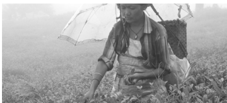
Pan-India e-auction ( http://m... )