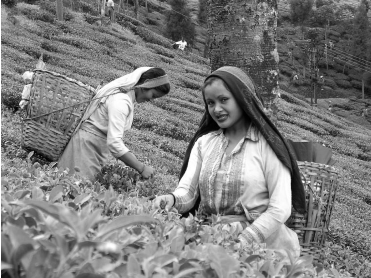
Small Tea Growers in India expecting a turn around with the new Tea Board development scheme

The Group Personal Accident Insurance Scheme for small tea growers launched by the Tea Board of India followed by the Parliament speech by Nirmala Sitharaman, the Indian Minister of State for Commerce & Industry, received a welcoming response from small tea growers of various tea-growing states such as Assam, West Bengal, Tamil Nadu, Kerala and Himachal Pradesh.