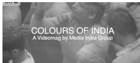
"Colours of India" ( http://med.. )