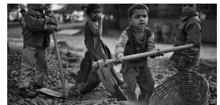
A drop in child labour in Ind