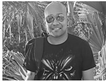
From Kidney Failure To Fitness Coach - Amazing Story Of A Survivor bigdecisions.com