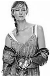
The April collection, inspired by The New Metallics trend Mango