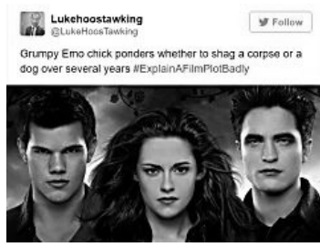
The World's Best Movies Described In One Sentence Time To Break