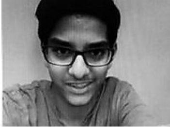
Boy kidnapped, murdered within minutes 18/03/2016