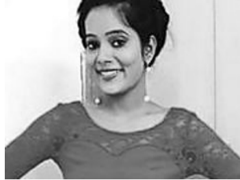
Telugu TV anchor Nirosha commits suicide 16/03/2016