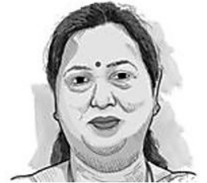
Tamil Nadu's power couple 31/03/2016