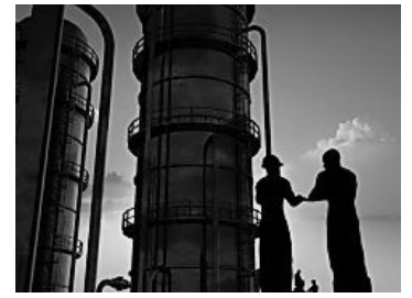
Carbon capture and storage key to slowing emissions growth Global Carbon Capture and Storage Institute