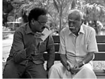
The man who made Rajinikanth 26/03/2016