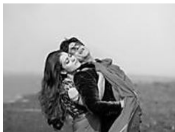
Dilwale: Heart attack 18/12/2015