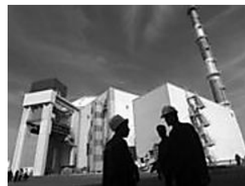
Iran ready to ship enriched uranium stockpile to Russia 19/12/2015