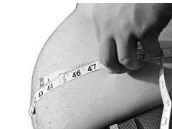
Mens Lower Belly Fat - 5 Tips To Make It Go Away! For Men