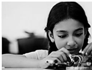
Time to change the future. Intel India