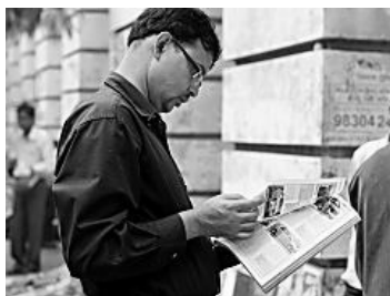
4 simple habits that increase your chance of success Abbott