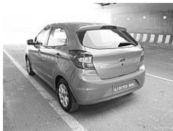
Finally Ford Reduced The Price For This Beast! Autoportal | Cars in India | Latest car prices in India | Car models