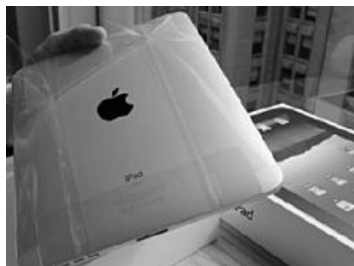
Experts shocked, as new trick saves online shoppers thousands in India MegaBargain 24