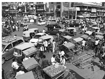
3 clever ways to avoid wasting time in traffic jams Abbott