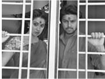
'People thought I was too good-looking to play a ghost' 28/11/2015