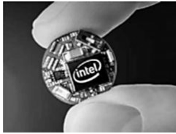
See why the next big thing is now, smaller. Intel India