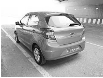
Finally Ford Reduced The Price For This Beast! Autoportal | Cars in India | Latest car prices in India | Car models