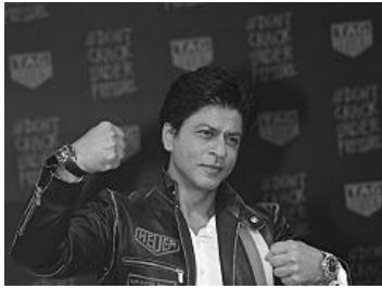
4 Qualities Of SRK That 'Gen Y' Needs To Imbibe To Make Their Mark! LiveInStyle.com