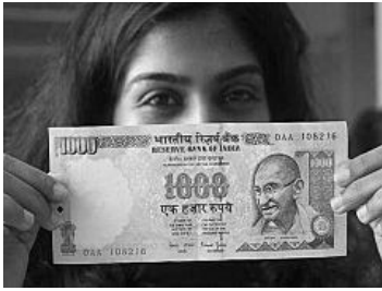
In 2 Easy Steps Save Upto 80,000 On Your Home Loan EMI bigdecisions.com | Smarter decisions | Financial tools | Blog