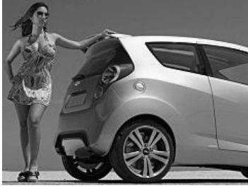
The Cheapest Car In India Is Already In Stock! Autoportal.com