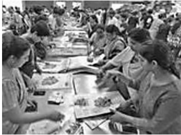
Factory-like precision at this mega relief centre 10/12/2015