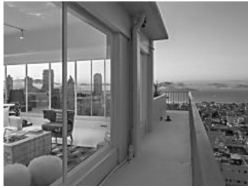
Amazing San Francisco Luxury Properties You Have to See to Believe Mansion Global