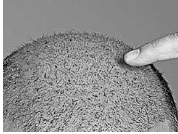
Unique Method May Regrow Lost Hair Lifestyle Journal